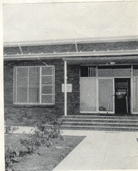
The main entrance of the Club in 1958.

with his personal offer of $2,000. Within ten minutes offers totaled $20,400-00". This is as far as the minutes go but it is a fact that brings credit to all members that by the evening of the same day the offers reached the total of $90,000.00. A building committee was formed and included V. Fiorelli, E. Intilia, R. Mauro, A. Fornasier, L. Raumer.