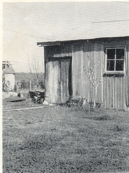
The first general meeting of the Club was held in this shed (Trivett Street, Horsley Park) on the 9th of September 1957.

The certificate of Registration of the club was issued the 11th November, 1957 pending the sale of liquor to 2 acres of the 5 acres the club then owned.